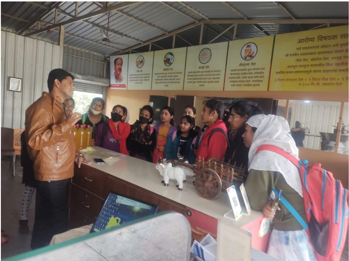
THE PRODUCER GAVE THE INFORMATION ABOUT MARKETING PROCESS