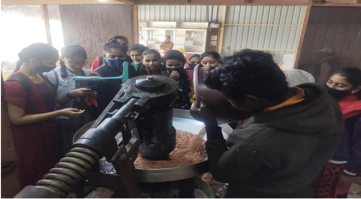
STUDENTS WATCHING A LIVE DEMONSTRATION OF OIL MARKETING