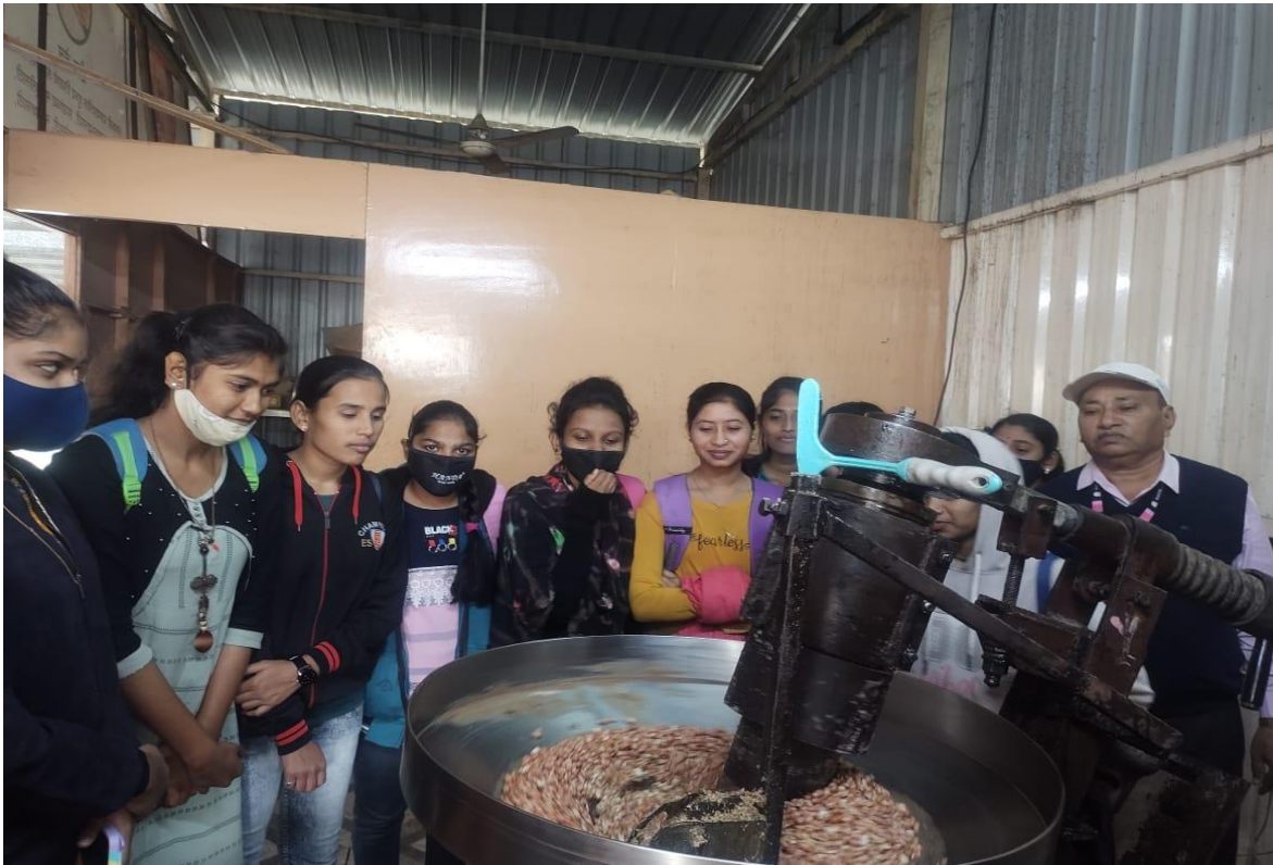
STUDENTS WATCHING A LIVE DEMONSTRATION OF OIL MAKING