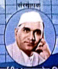
कर्मवीर भाऊराव हिरे