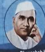
Karmaveer Bhausaheb Hiray