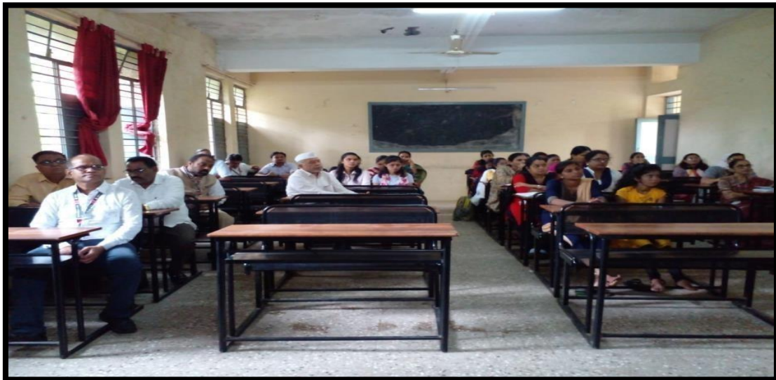
Audience present on the occasion of lecture on 'Loksankhya Samasya ki Sampada'